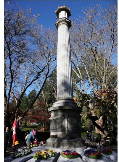
War memorial for Japanese Canadian veterans in Stanley Park, Vancouver