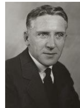
Bertram Brooker 1888-1955

While best known for his painting and drawing (both pencil and ink), his writing and advertising work are recently receiving more scholarly attention and a new book of prose (short stories and essays) was published in 2010, The Wrong World .