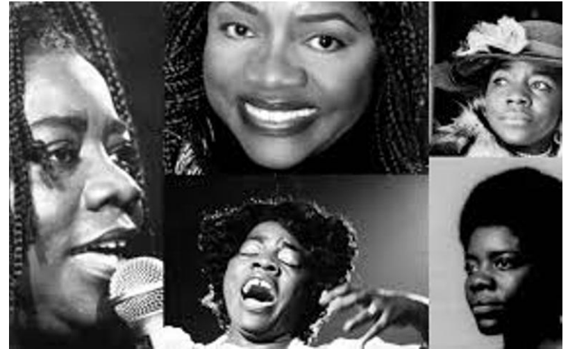
Salome Bey 1933 - 2020

dating back over 50 years, is a moving tribute to one of Canada's best-known singers and songwriters, who paved the way for Black artists in theatre.