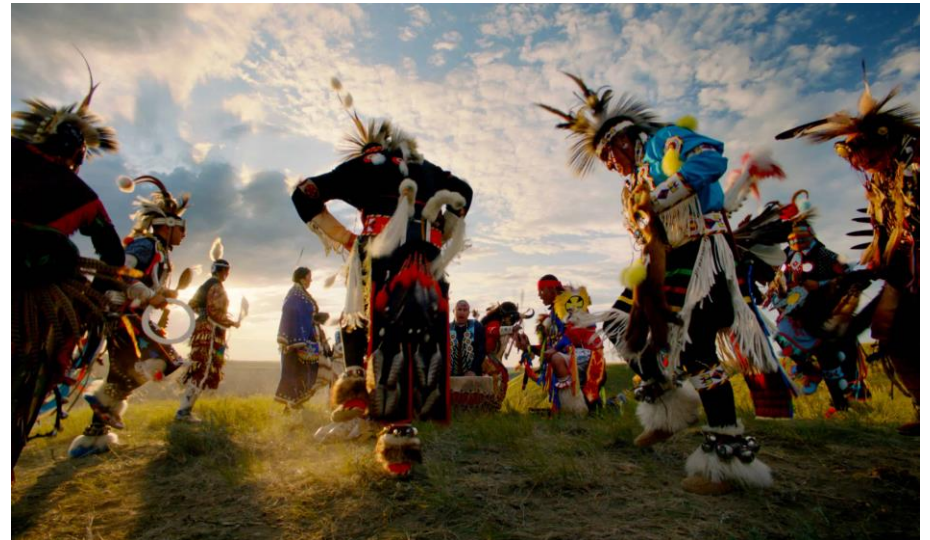
Have a Blessed Day!