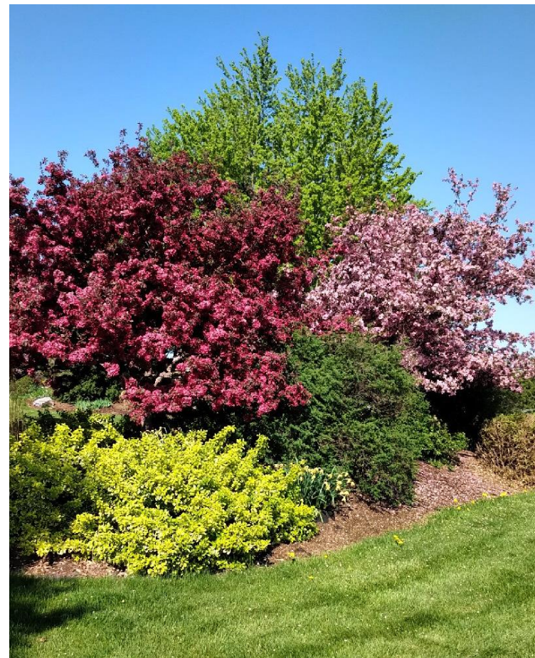
Crab apple trees at Rev. Cooper's home, 2021.

God bless you , stay well, and we hope you join in next week...same day, same time, same number and video link.