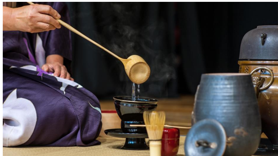
Japanese Tea Ceremony

God bless you , stay well, stay safe and we hope you tune in next week...same day, same time, and same Zoom phone number or video link.